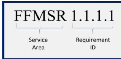
Figure 2: FFMSR Identifier Notation